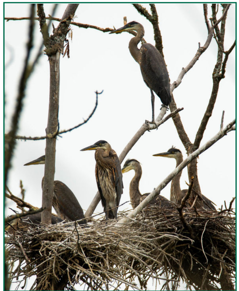
Heron Rookery.

There's more to come on upcoming conservation committee activities and opportunities. As year's end draws near, we encourage you to reflect on how you engage our community with respect to birds and our natural world. Birds need the help of thoughtful, committed citizens now more than ever.