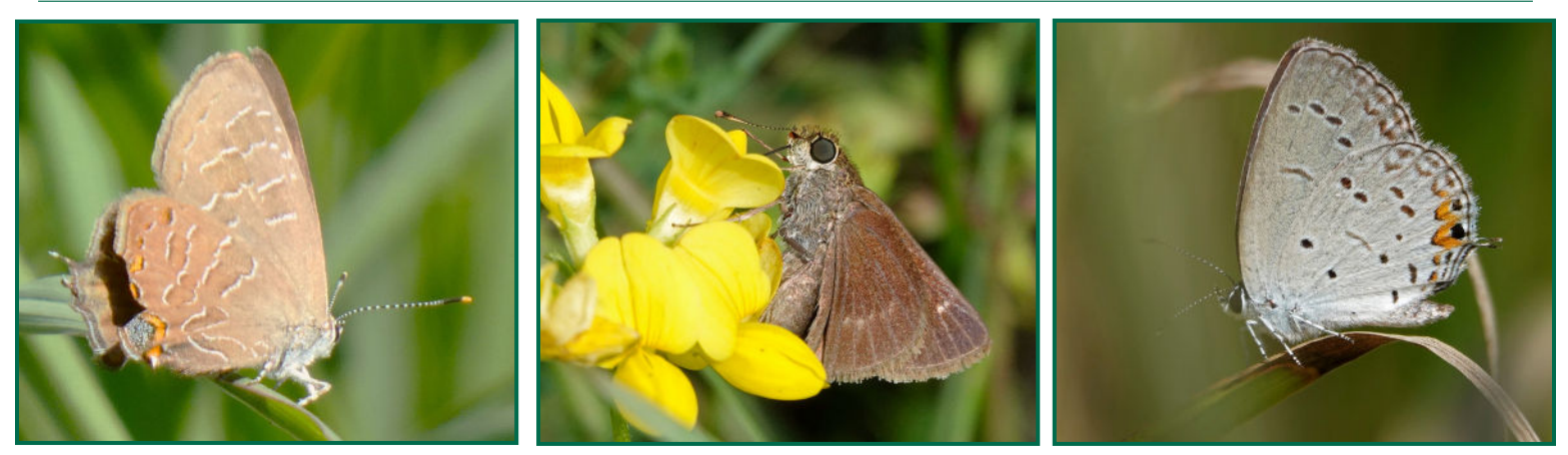
Species above, left to right: Striped Hairstreak Eastern Tailed-Blue and Dun Skipper

Thanks again to all 2023 participants! Next year's count is scheduled for Saturday, July 6; look for registration information in the June/July issue of The Cardinal newsletter.