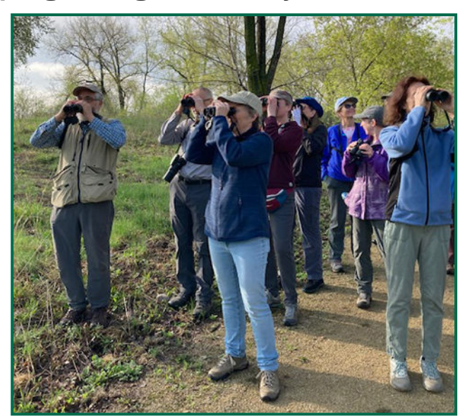
Above: Old Cedar Bridge on May 5; Below: Snail Lake on May 9