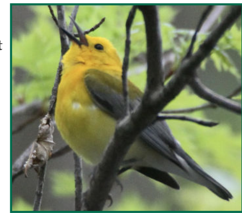
Scarlet Tanager, Prothonotary Warbler, Golden-winged Warbler

through Sunday morning and others staying for only part of the day on Saturday. As always, it was a great time to revisit favorite birding spots from Lake City to Frontenac State Park with other birders and have many keen eyes spotting special species.