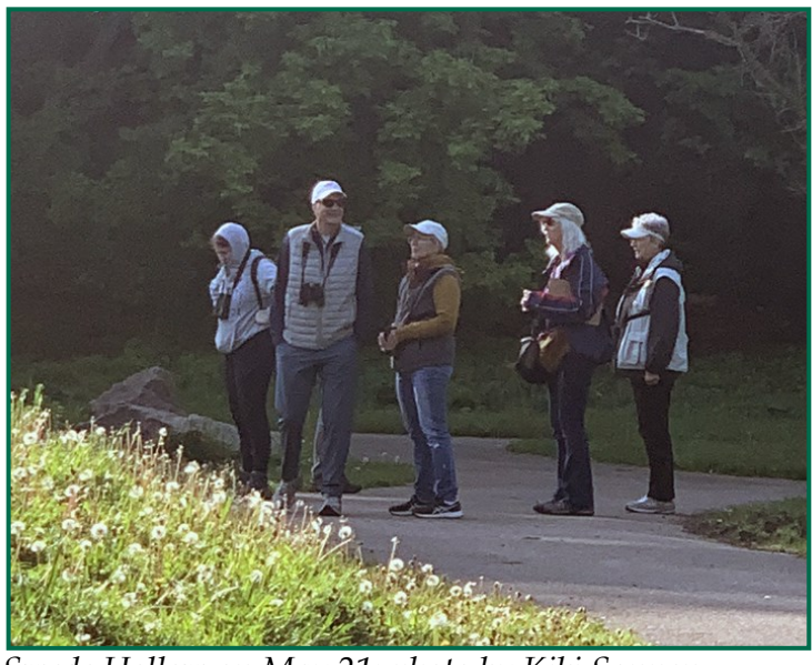
Swede Hollow on May 21